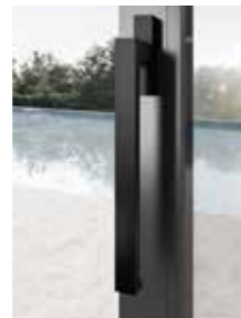
LIFT & SLIDE EDITION